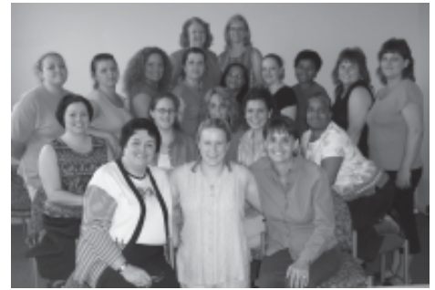
HF Oneida County Staff

Along the way we have paused to take a breath and acknowledge our strengths: we have many lovely children—in the families of both staff and participants; we have annual events for families and for staff that offer opportunities for socialization, celebration, and education; we have stretched ourselves and participated in producing a