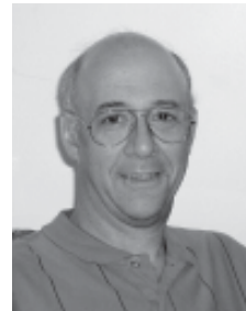
Thanks again and all the best to you and your co-workers.

miracles. It gives us something to hold onto and the strength to resist the negative forces swirling around us. Helping them focus on how they could both help and support their child—instead of rehashing the past—created the foundation for re-establishing communication, and that was essential for the best possible outcome. I'm curious to know how they were able to get beyond the old patterns when they cropped up. It is so wonderful that you have been able to support the dad in his parenting, and I wonder how much of your support of their communication allowed him to get to this point. What do you think? Clearly his wanting you to continue visiting was a result of seeing the value of your involvement. Finally, your story reminds me a little bit of the Public Health Nurse video I show. At first things seem so stressful and overwhelming that the situation seems impossible. Then, by looking for when it's working, the stress starts to melt away and our purpose with the family becomes clearer. Letting the baby provide the energy for the work revealed that she and the dad were doing wonderful things together. What a powerful way to melt stress!