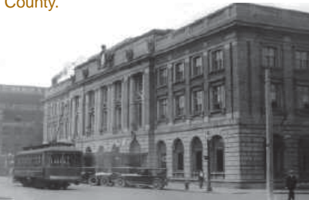
Union Station, Utica

The Utica area has the fourth highest density of refugees in the U.S., with immigrants from 22 different countries. The population of Utica is currently 10% Bosnian. These demographic and economic transitions and increasing diversity of background and language are key to understanding present-day Oneida County.