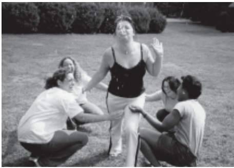
HF Oneida County staff demonstrate "a fountain" during charades at Staff Wellness Day