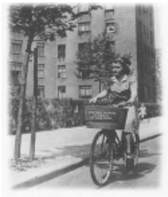
Nurse on her way to a home visit. Home Visiting has a long history in Central NY—the Visiting Nurse Association of Utica & Oneida County was founded in 1915.