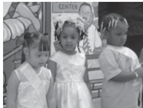
Recent program graduates at Special Beginnings, Brooklyn

Nicotine patches and nicotine gum are available over-the-counter. Nicotine nasal spray and inhalers are available only by prescription.