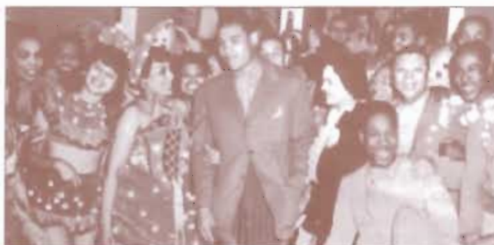
Joe Louis, Heavyweight Champion of the World, at the Apollo Theater, sometime around 1940.

Today Harlem is truly a multi-ethnic community. Along with the African-American population, Harlem is also home to many immigrants from Africa, Latin America, and the Caribbean.