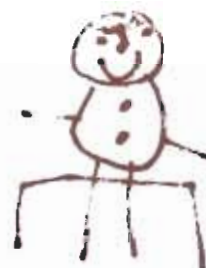
Iggy eats lunch

Remember SEPTEMBER is Safe Babies month. Knowledge and education are powerful tools. Thank you for all you do to support parents in keeping their babies safe.