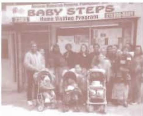
off to the circus!

In addition to visits, pediatric residents provide BABY STEPS staff with training. Some topics they have covered include: failure to thrive, fetal alcohol syndrome, infant development, shaken baby syndrome, and car seat safety. The staff, families and residents alike have benefited greatly from this collaboration. Families have increased knowledge about various family health issues and have felt honored to have doctors who do house calls! This year we began collecting information to evaluate the experience of families, residents, family support workers and how successful we have been at ensuring continuity of care for families.